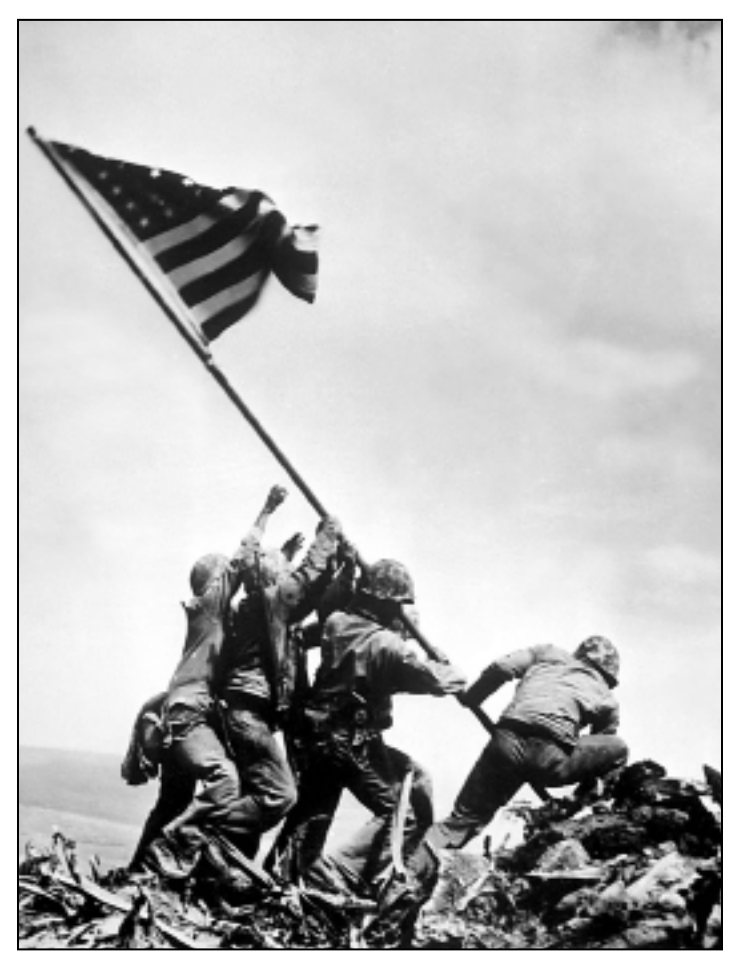
Associated Press photographer Joe Rosenthal's shot became one of the most recognized and iconic images of World War II.

Reprinted with permission by the author from Iwo Jima Journal and Wannabe Heroes, 2006.